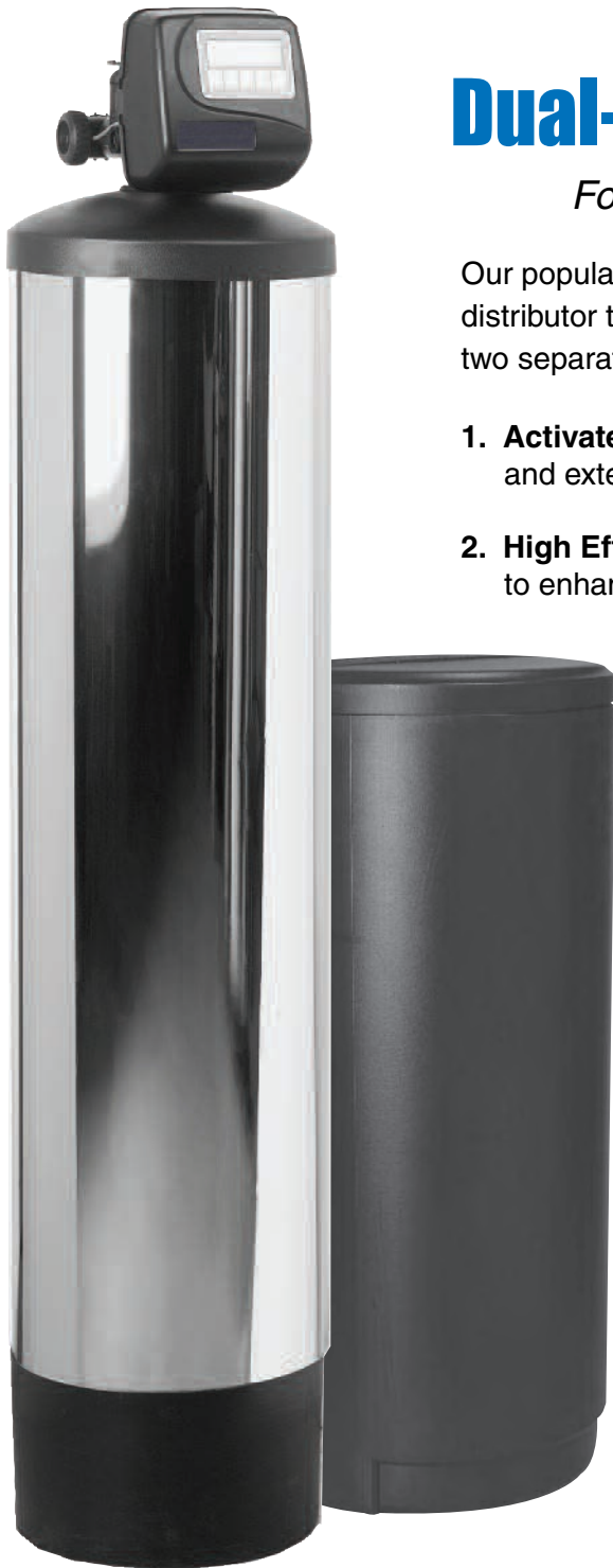
Shown with optional stainless steel jacket